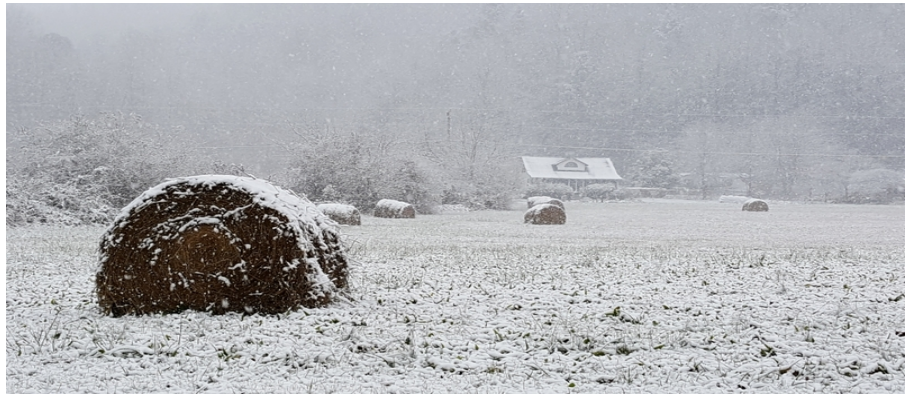
By Charlotte Comstock