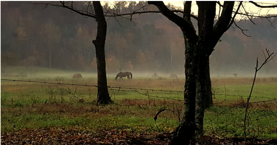
By Charlotte Comstock