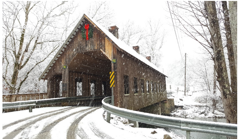
By Charlotte Comstock

Thanks to all who sent your beautiful pictures of Pittman Center.