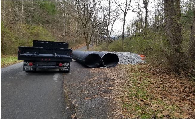
MAINTENANCE DEPARTMENT STAGING FOR TUNIS BRANCH TILE REPLACEMENT

of Tunis. The previous tile was failing and causing the road to sink. The Maintenance Department was able to replace the tile and ensure that the structural integrity of the road is maintained. We have also worked to create a Streets and Public Works Log. If you have any road requests or see opportunities please let us know. We track progress on infrastructure improvements on a monthly basis and include the updated log in the monthly Board of Mayor and Aldermen packet.