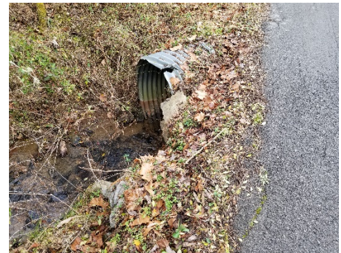
OLD TILE ON TUNIS BRANCH

working on a tile replacement on the Webb Creek side