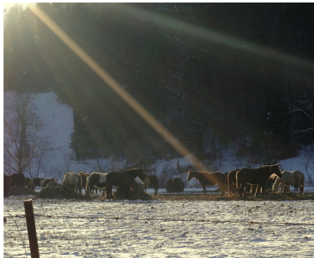
By Charlotte Comstock