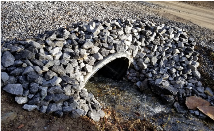
NEW TILE ON TUNIS BRANCH

The Town’s Maintenance Department has continued working on small projects during the last few weeks. Most notably, the