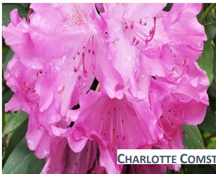
CHARLOTTE COMSTOCK PHOTOGRAPHED THE BEAUTIFUL SURROUNDINGS ON EMERTS COVE