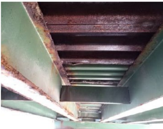
HEAVY CORROSION LOSS OF SECTION BOTTOM DECK BETWEEN BEAMS C/D SPAN 6