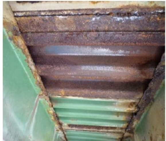
HEAVY CORROSION BOTTOM DECK SPAN 1 BETWEEN BEAMS B/C