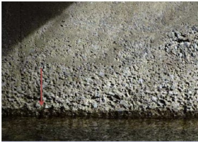
HEAVY SCALE EXPOSED REBAR BASE PIER 4