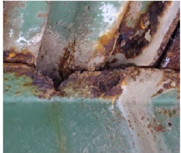
HEAVY CORROSION LOSS OF SECTION TOP FLANGE BEAM B SPAN 1