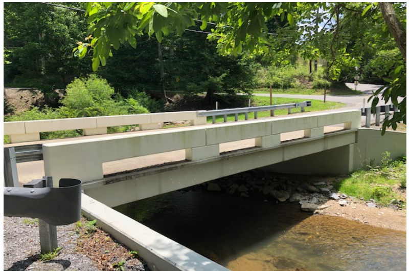
Webb Creek Bridge After Replacement

Did you know...? In October of 2017 the Town of Pittman Center entered into an agreement with TDOT to replace the Webb Creek bridge. This contract provided the Town with a 98% match using funds from the State of Tennessee. This allowed us to complete this approximately $435,000 project for around $10,000! The State funded this project through a Bridge Grant. According to TDOT's website, "The Bridge Grant Program was established to assist local governments with the replacement or