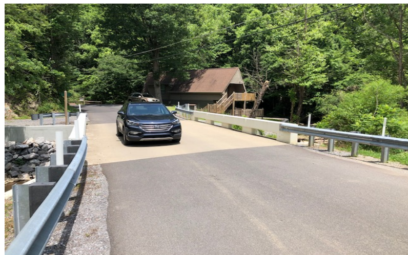
Webb Creek Bridge After Replacement

rehabilitation of deficient bridges under their jurisdiction. Since the inception of the original program in 1982,