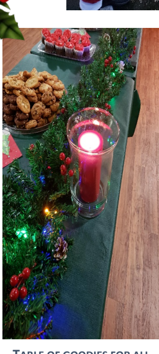
TABLE OF GOODIES FOR ALL